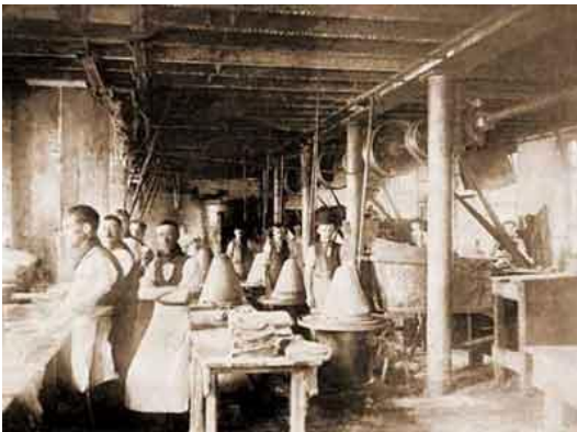
Victoria hat Works, Wilton St, interior