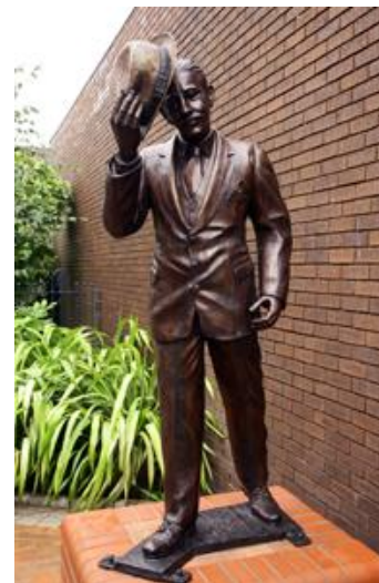
Statue near Denton Town Hall 'Tipping the Denton Linney'