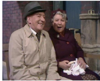
Wilfred Pickles wearing the Attaboy in an episode of 'For the Love of Ada'