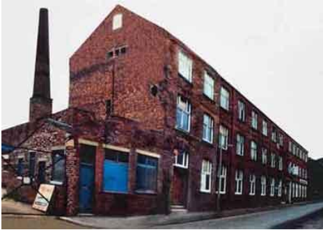
Victoria hat Works, Wilton St, Denton